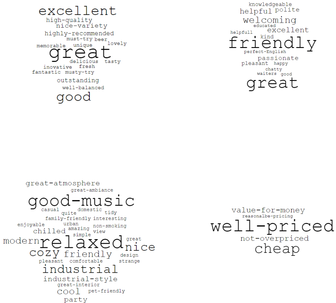
Figure 2. Word clouds for beerscape attributes: (1) beer quality, (2) service staff, (3) atmospherics, and (4) beer value.

In addition to the analysis of the frequency of mentions of particular beerscape attribute, the positive key words relating to the particular attribute, found relevant from the previous research (beer quality, service staff, atmospherics, beer complementary product, beer value), were also extracted from the reviews which were written in more detail. These words were then used to form word clouds shown in Figure 2.