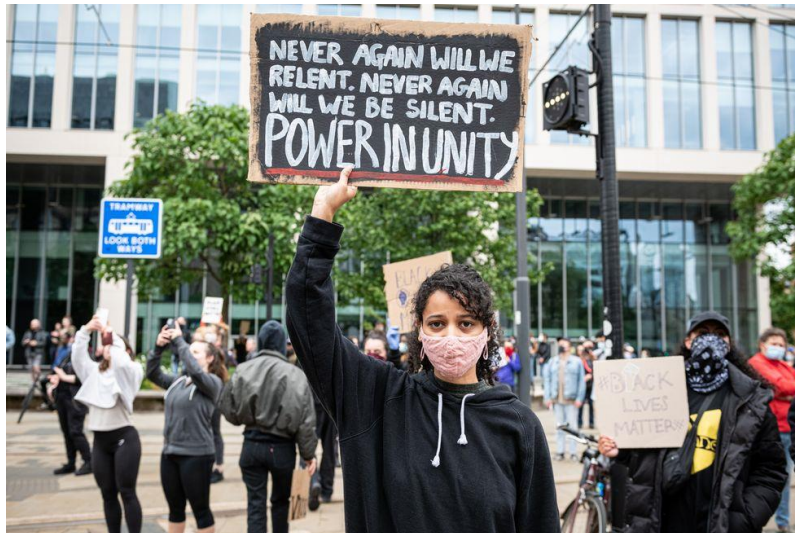
Fig. 1. “A young woman holding a sign that states: “Never again will we relent. Never again will we be silent. Power in unity.” during the Black Lives Matter protests of 2020.” (O’Malley, Katie. “How Black Lives Matter Protests Have Changed the World, A Month After George Floyd’s Death.” Elle , 25 June 2020 https://www.elle.com/uk/life-and-culture/culture/a32822672/black-lives-matter-protests-achievements-statues-police-reform/ . Accessed 4 September 2020.)