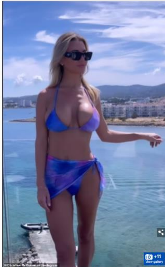
Wow! Christine McGuinness showed off her incredible figure in sexy swimwear on Monday as she shared a series of stunning clips from her sun-soaked holiday in Ibiza

PUBLISHED: 08:49 BST, 9 May 2023 | UPDATED: 15:12 BST, 9 May 2023