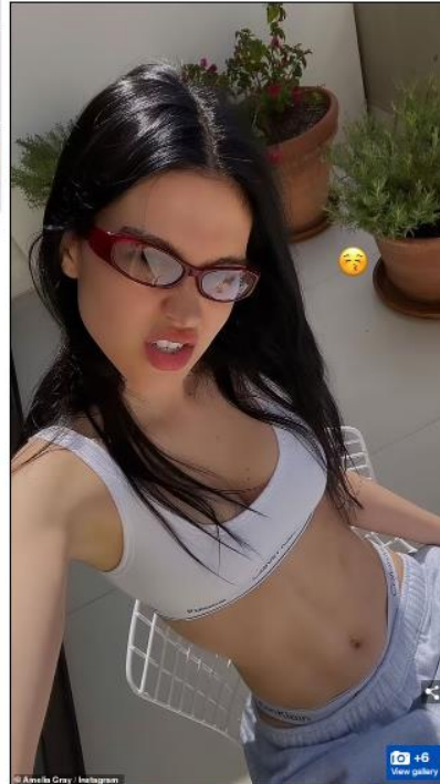
Outside: The daughter of Lisa Rinna, 59, and Harry Hamlin, 71, showcased her sculpted abs in a tiny white bra and black panties from Calvin Klein