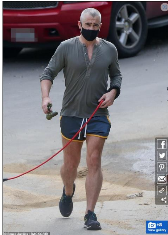
Silver fox: Colin Farrell proved to be a silver fox on Wednesday afternoon as he embarked on a stroll around Los Angeles, after recently debuting a bald head

PUBLISHED: 02:21 BST, 11 February 2021 | UPDATED: 02:49 BST, 11 February 2021