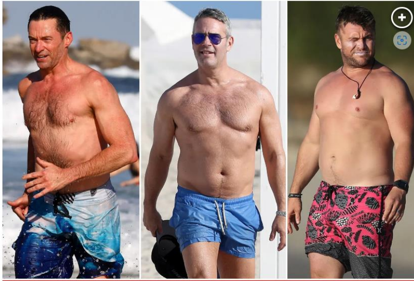
Hugh Jackman, Andy Cohen and Luke Hemsworth rock various "dad bod" forms at the beach.