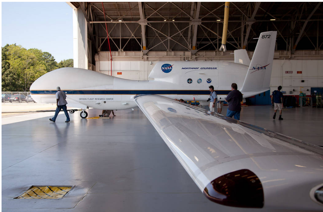
Picture 9: US Northrop Grumman Global Hawk reconnaissance and science drone.