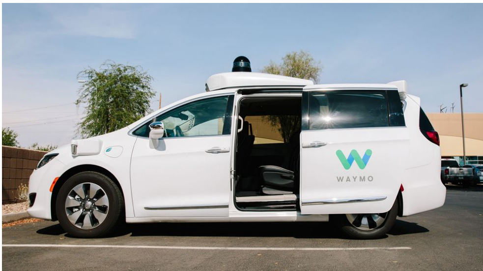
Picture 3: Waymo Autonomous taxi company which served over 100,000 customers

The Future of Driving report from Ohio University states that with autonomous taxis, "The waiting time for a cab will come down from the average five minutes today to just 36 seconds. The cost of a ride too will come down to just $0.5 per mile in a driverless car." 28 Since every autonomous vehicle will be able to be used for ridesharing, the ridesharing market will be huge. Mobility will be cheap, reliable and everyone will be able to afford it. It is likely to happen that ridesharing becomes so efficient that many people will choose not to have a car and yet to be driven every day constantly.