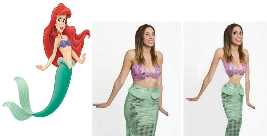
Picture 4. Ariel as a human 12