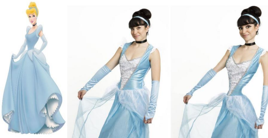
Picture 3. An example of a realistic Cinderella body. 11