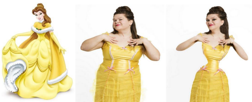
Picture 5. Belle as a human 13

figure. She meets the Beast after her father is imprisoned by him. The Beast is quite wealthy and lives in a large mansion, with nearly all the traits of a Disney's prince, but he is very ugly. Belle falls in love with the Beast, and, the spell, that made him ugly disappears so he becomes a handsome Disney prince. Analysing the message through Barthes primary level, we see a story of a woman who falls in love with a man despite his physical appearance. We applaud this woman as she has done a good action, and seen the true side of a man. Analysing the myth we see that the story promotes the idea that if a woman falls in love with an ugly and abusive man, she will be rewarded, move to a castle and he will become a prince. But is this quite possible off screen? According to Beres, issues such as control and abuse over women are romanticized in these animated movies. This imposes that some women may interpret this abuse as a sign of love and believe they have a strong and loving partner beside them (qtd. in Towbin, et al. 25). Not only does this have bad consequences on women but it also teaches young girls that even though someone might be even "only" verbally abusive, if you are good to him he will change his ways and become a good and nice person. Ideologies such as these make women believe that they should stay in abusive marriages as their husbands, just like the Beast may change one day.