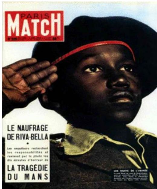
Picture 2. Cover page of Paris-Match magazine 4

a magazine Paris-Match with a picture of an African American soldier saluting to something, probably the French flag.