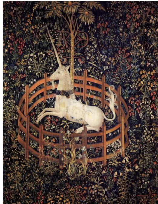
Fig. 5. Gothic narrative tapestry representing the hunt of a unicorn. From Unknown weaver. The Unicorn in Captivity . 1495-1505. Metropolitan Museum of Art. New York. www.wga.hu . Web. 23 October 2015.