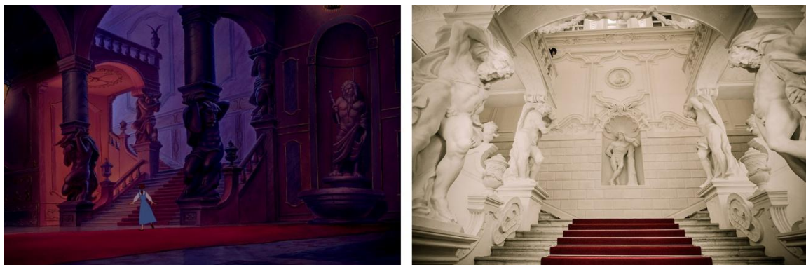
Fig. 11. Staircases in the Beast's castle (left) and in the Winter Palace of Prince Eugene in Vienna (right) look almost the same.

Other than nature, the Beast's castle represents another quintessential setting of the entire film in which the audience follows the development of the protagonists' relationship. As it was previously mentioned, architecture, as well as all the other aspects of the set design, only inspired animators to create their own imaginary world. Still, many architectural elements were taken from both French Renaissance and Baroque architecture. During their trip in France in 1989, animators visited the Renaissance château of Chambord the grandeur