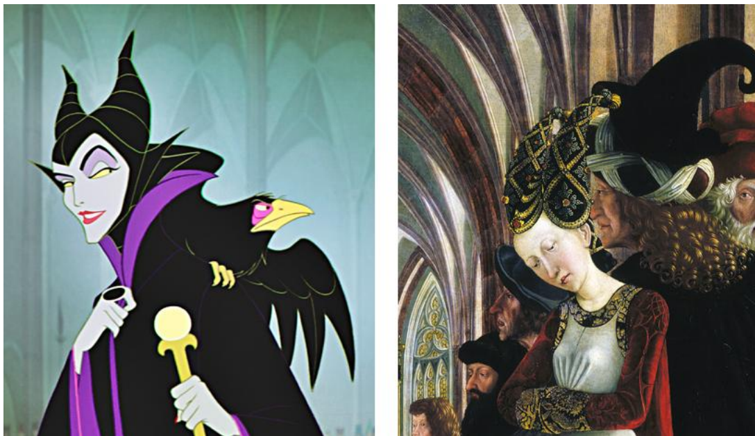
Fig. 8. A headdress similar to this one worn by the lady (right) on Michael Pacher's St Wolfgang Altarpiece (1479-1481) inspired Maleficent's visual appearance (left). From Pacher, Michael. St Wolfgang Altarpiece: Christ and the Adulteress . 1479-1481. Parish Church. Sankt Wolfgang, Austria. www.wga.hu . Web. 23 October 2015.

four. Three good fairies Flora, Fauna and Merryweather give a sense of comic relief, while the fourth one, Maleficent, provides the element of horror. Her character of an independent, fierce, strong lady was built on the legacy of the Evil Queen from Snow White and the Seven Dwarfs , as they are both gorgeously dangerous, and impeccably nightmarish. Sometimes her character might seem even more important than all the others, mainly because she, in contrast to Perrault's story, starts all the action in storyline, from arriving to Princess Aurora's