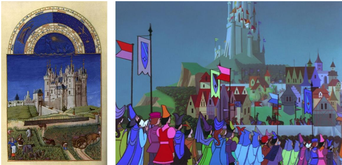
Fig. 6. Limbourg brothers' gothic illustrations (left) inspired the scene showing the procession honoring the newly born princess Aurora (right). From Limbourg brothers. Septembre . 1412-1416. Musée Condé. Chantilly. www.wga.hu . Web. 23 October 2015.