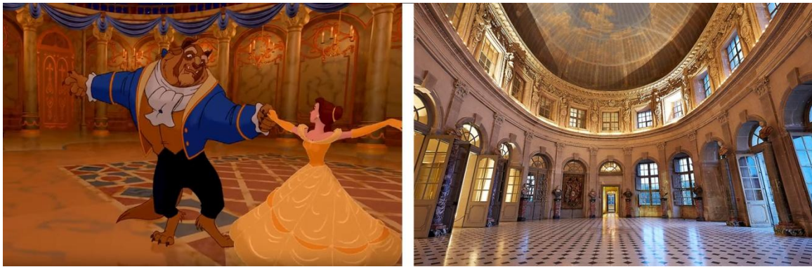
Fig. 12. The Beast's ballroom (left) resembles the structure of the Grand Salon of the Château Vaux-le-Vicomte in France (right). From Le Vau, Louis. Vaux le Vicomte. 1658-1661. Maincy. France. www.vaux-le-vicomte.com . Web. 23 October 2015.

Prince Eugene in Vienna, Austria, surprisingly resembles the staircase of the Beast's grand foyer (see fig.11). Four symmetrically arranged monumental sculptures of beasts holding the staircase construction correspond to the four Atlants holding the staircase construction in the Viennese Palace designed by the Austrian Baroque architect Fischer von Erlach. Not only does the animated staircase imitate the original Baroque construction, but the sculptures of the beasts follow the torsion of the muscular Atlants' bodies caused by the pressure of the lavish Baroque architecture. The pathos on their faces, frequent in Baroque sculpture, suits well the agony and punishment Beast carries on his shoulders, similar to the mythical Atlantes punished to eternally hold the sky on their shoulders.