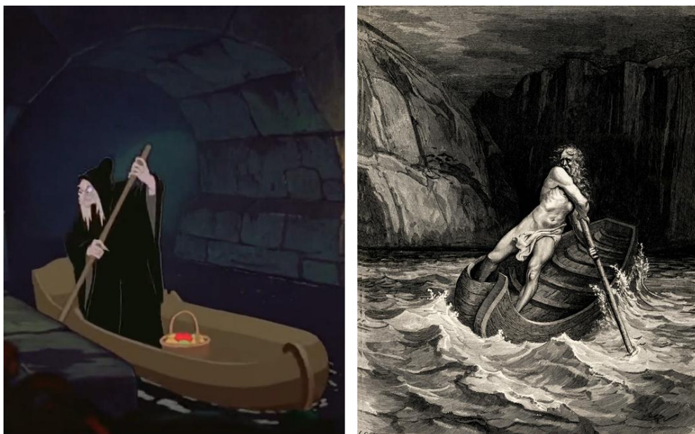
Fig. 2. Visual concept of the Evil Queen dressed up as Witch leaving the castle in a boat (left) was developed on one of Gustave Doré's illustrations of Dante's Inferno (right). From Doré, Gustave. Illustration to Dante's Divine Comedy . c.1855. Various Collections. www.wga.hu . 23 October 2015.

lovely bosquet filled with friendly forest animals. Here we can see how Disney combines duality between European art and American reality in the form of North American flora and fauna. Another Gustave Doré's illustration from Dante's Inferno served as a template for one of the scenes from the film – the one with the Evil Queen dressed up as Witch leaving the castle in a boat (see fig. 2). Some of the uptight gestures from Gustave Doré's illustration, and his expressive atmosphere were successfully transmitted onto the silver screen: a hunched old hag with her thin and scrawny hands grabbing a paddle and setting out into the mist, with only one aim so easily readable from her spiteful gaze – to kill the Fairest of Them All. Apart