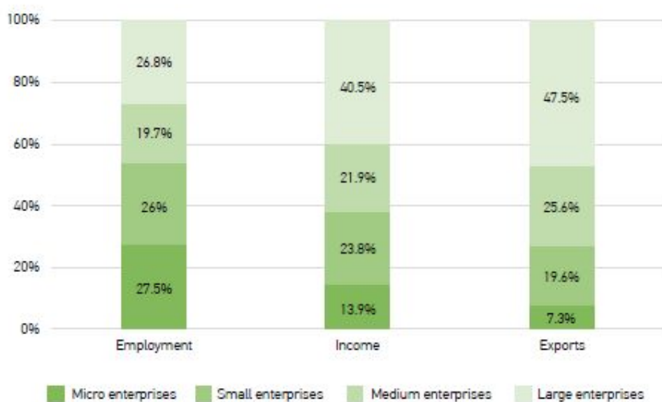
Figure 1 (employment, income and export by the sector) FINA