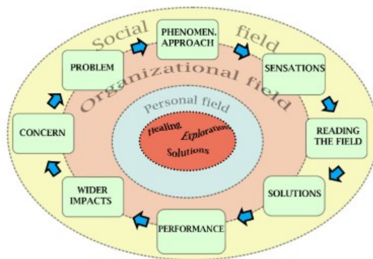
Fig.1 Phase model of client's path through SCW

The impacts of business constellations extend across the boundaries of the organization in question. They can help with personal problems that are nowadays normally transferred to business, especially by business leaders who are by default busy people. They can also affect teams, organizational partners, and even markets and society as a whole. The best outcomes are reached when a combination of SCW, business analytics and professional are used. Eventually, any solution reached in a constellation will result in a new concern, and thus SCW can be seen as a revolving process.