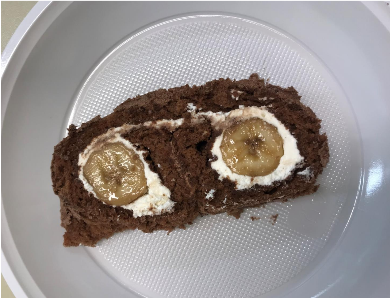
Figure 5. Traditional banana roll