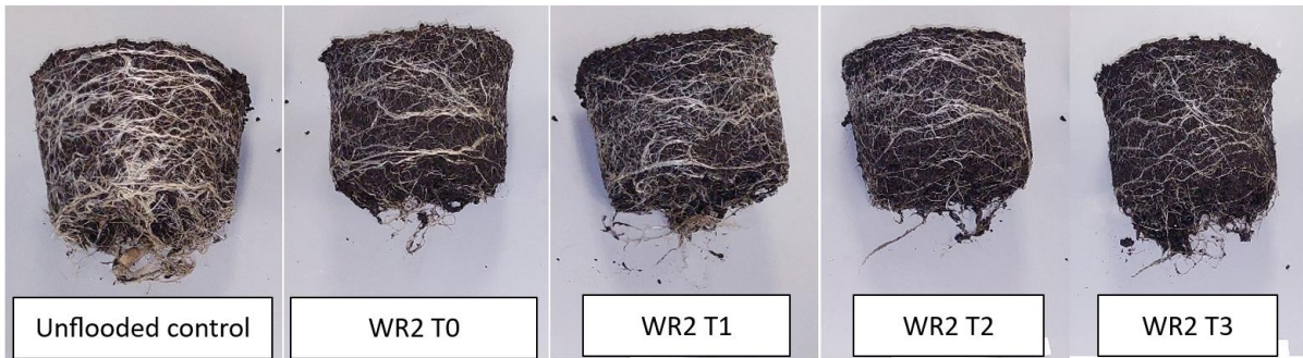
Figure 3. Root systems of Brassica oleracea var. capitata under different treatments: Unflooded control, later flooding control (WR2 T0), later flooding ExelGrow ® treatment (WR2 T1), later flooding Organico treatment (WR2 T2), and later flooding Eco Green treatment (WR2 T3).