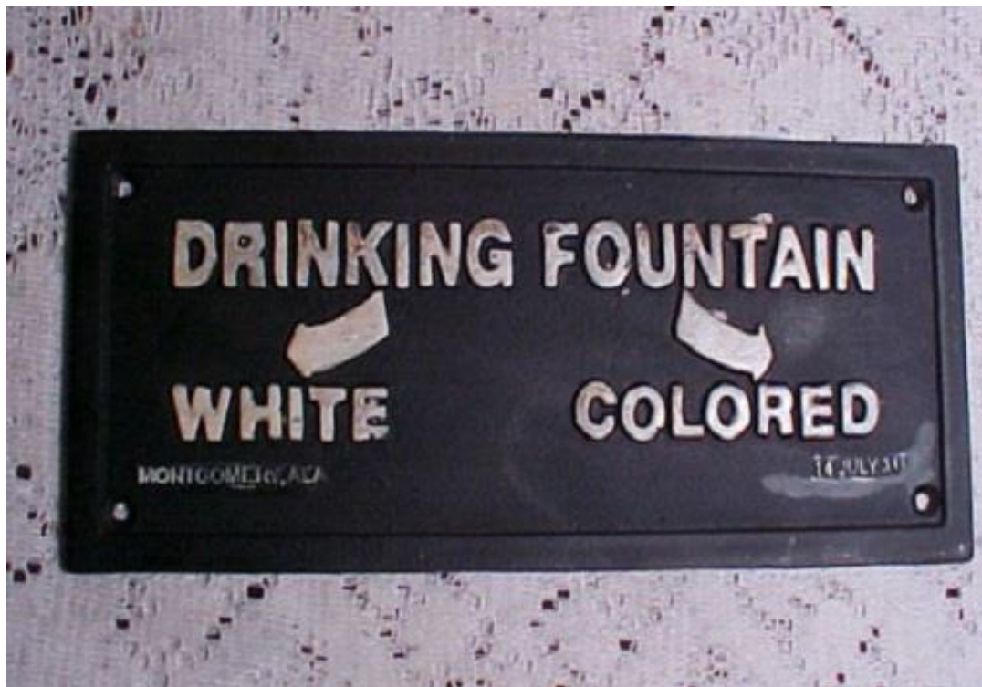
Fig 1. A sign in Montgomery, Alabama, showing separate drinking fountains for blacks and whites (“Jim Crow Laws.” African American Civil Rights Movement , http://www.african-american-civil-rights.org/jim-crow-laws/ . Accessed 27 June 2019.)

But this system did not treat all races equally and was used for decades in order to maintain a sense of superiority of the white race dating back to the days of slavery. “Jim Crow became a self-perpetuating system for several decades” (Brown and Stentiford 19). It also played a significant role in the creation and reinforcement of existing stereotypes “that had once served to justify the enslavement of blacks” (Harris 5) and led to discriminatory behaviour and the belief in white supremacy.