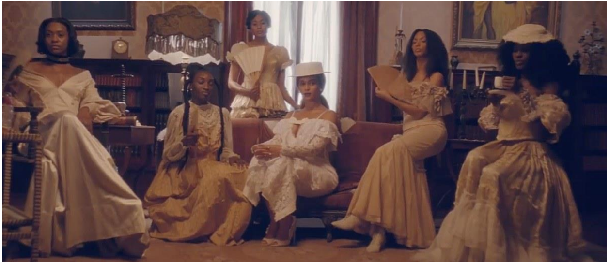
Picture 1. Beyoncé with some African American women in the “ Formation ” music video

through her lyrics and videos. Her whole band and dancers are African Americans. In the video for the song “ Formation ” it is especially vivid in the sense that she brought her daughter, along with some other famous African American women to stand together in a formation, to fight for their rights, to be equal.