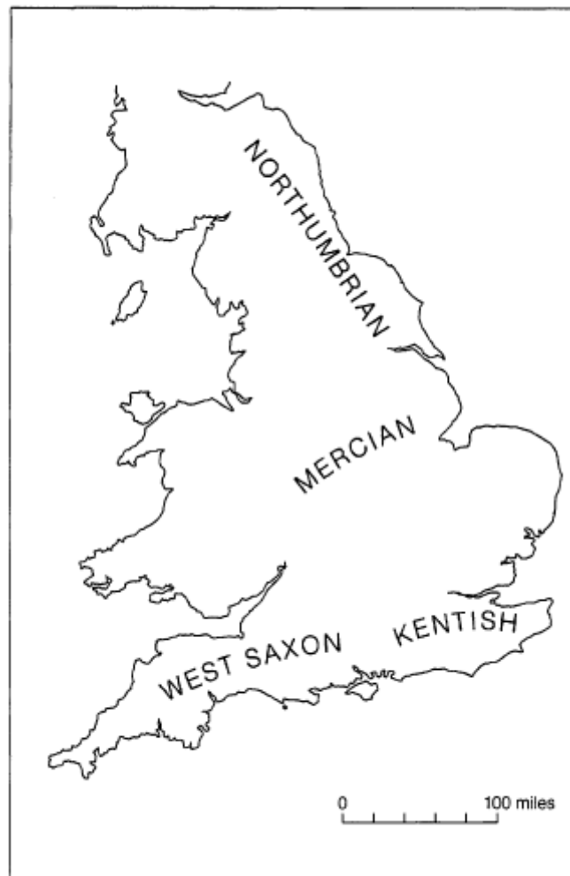
Figure 2.2 Old English dialects (Knowels, 1997; p. 35)