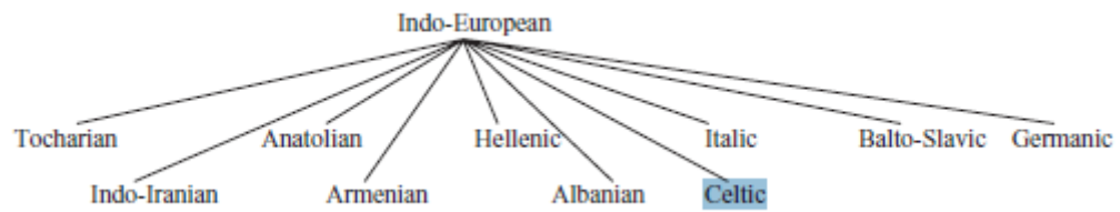
Figure 2.1 The Indo-European Languages (Hogg, Denison, 2006; p. 5)

which only became evident in the morphology and syntax of written English after the Old English period (Hogg, Denison, 2006). Scottish Gaelic, which belongs to a Celtic branch, is still spoken in Scottish Highlands.