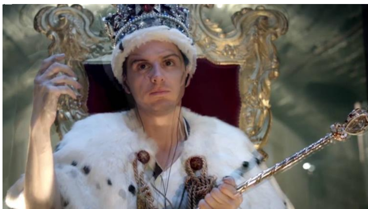
Fig. 7. Jim Moriarty (Andrew Scott). The Reichenbach Fall . Writ. Gatiss, Moffat and Thompson. BBC. 2012. Television.

In The Final Problem , Sherlock’s death is not so vivid, not at all that articulately planned; in fact, most of it is left to speculation and imagination. Watson recalls: “And then what had happened? Who was to tell us what had happened then?” (Doyle, TFP 412) It is, however, considered that the two men engaged in a physical fight and then both fell of the cliffs