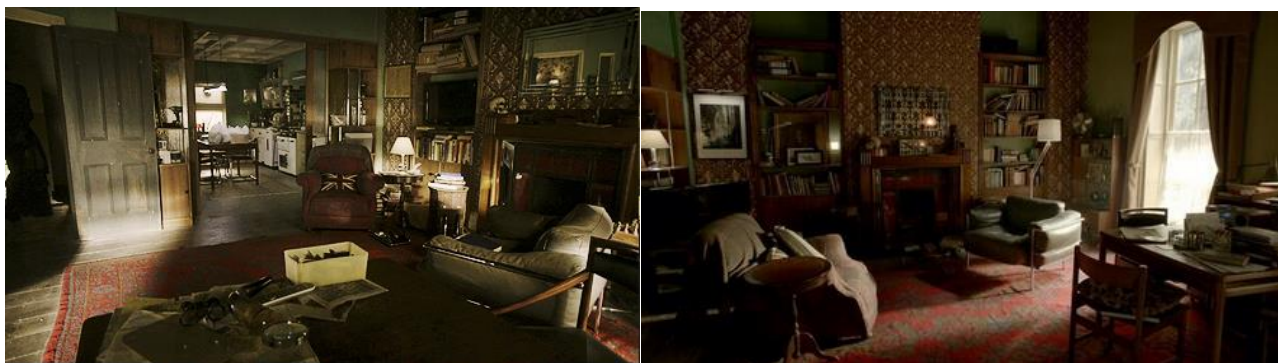
Fig 4. The set of 221B Baker Street flat in BBC studio. Sherlockology on Set: A Visit to 221B . Sherlockology, www.sherlockology.com/news/2014/1/17/sherlockology-on-set-a-visit-to-221b-170114 .

The set of the flat on 221B Baker Street is dedicated to details – “tiny pictures arranged along the hallway walls, a collection of well-worn boots on the landing outside the flat, a single car that is permanently parked outside on the gigantic photo-stitch of Baker Street/ North Gower Street, and a generally vast amount of clutter.” (Sherlockology) The production designer Arwel Wyn Jones says that it contributes to the sense that it is a real place. A modern design of the flat would not do; a retro renovation of the place was needed to bring the atmosphere that was present when Doyle imagined the flat in which Sherlock’s and John’s everyday life intertwined with their adventures. (see fig. 4)