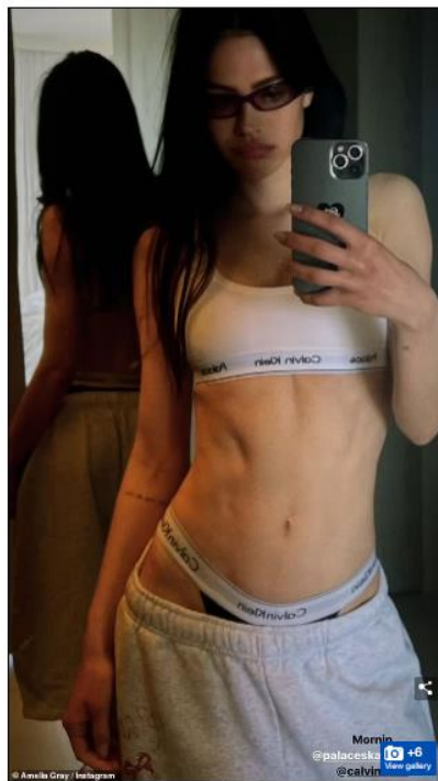
Trim tummy: Amelia Gray Hamlin, 21, showed off her tiny torso in a pair of selfies she shared to her Instagram Stories on Sunday

She also wore a pair of gray joggers slung low on her hips.