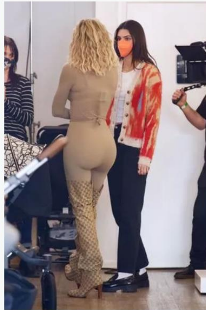
She completed her look with Gucci thigh high boots