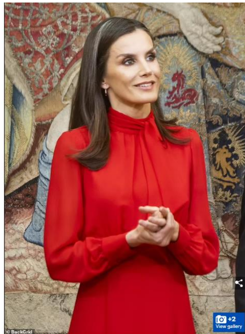
Queen Letizia of Spain pictured earlier this month, sporting a streak of her grey hair at an engagement

PUBLISHED: 20:04 BST, 26 March 2023 | UPDATED: 20:06 BST, 26 March 2023