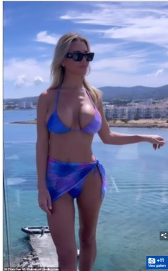
Wow! Christine McGuinness showed off her incredible figure in sexy swimwear on Monday as she shared a series of stunning clips from her sun-soaked holiday in Ibiza