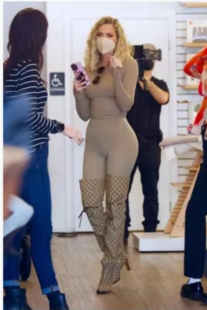
Khloe looked incredible in a nude jumpsuit Start