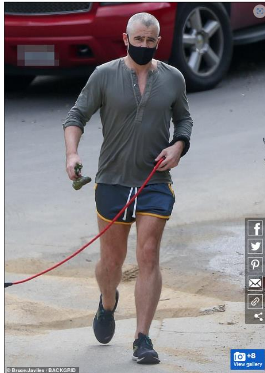
Silver fox: Colin Farrell proved to be a silver fox on Wednesday afternoon as he embarked on a stroll around Los Angeles, after recently debuting a bald head

PUBLISHED: 02:21 BST, 11 February 2021 | UPDATED: 02:49 BST, 11 February 2021