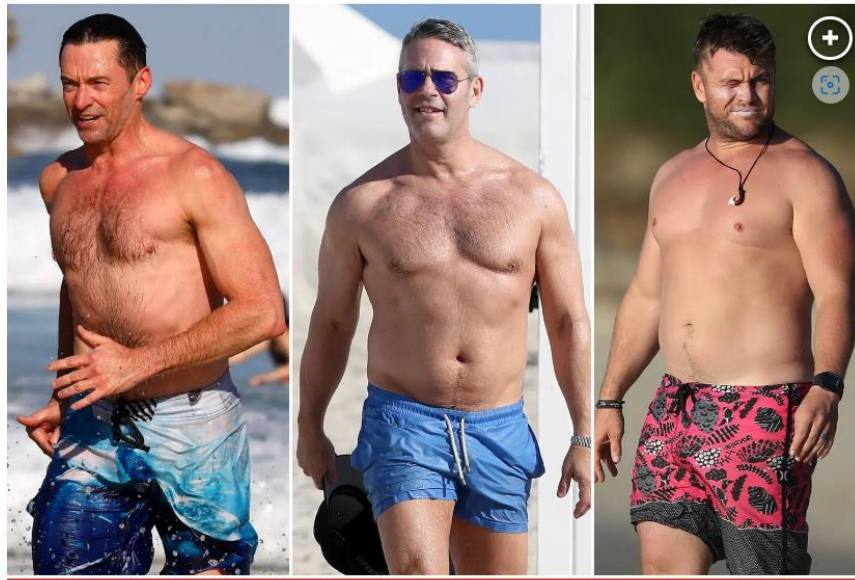
Hugh Jackman, Andy Cohen and Luke Hemsworth rock various "dad bod" forms at the beach.