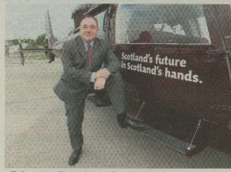
Učinimo to! – škotski premijer Alex Salmond

ške, ratne mornarice i ratnog zrakoplovstva. – Fikcija je govoriti o regionalnim oružanim snagama. Podjela Ujedinjenog Kraljevstva može ili ne mora biti politički ili ekonomski osjetljiva, ali vojno gledano sve je jasno: ona će nas sve oslabiti, poručuju bivši vojni zapovjednici u zajedničkom pismu. U Škotskoj se dugo očekivalo i kako će se o referendumu izjasniti škotsko izdanje Suna, tamošnjeg najtraženijeg dnevnog lista. Na kraju se Sun nije izjasnio ni za ni protiv i poručio biračima da je riječ o njihovom glasu i njihovom izboru.