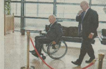
Njemački ministar financija Wolfgang Schäuble još se nije izjasnio o najavama francuskog kolege Michela Sapina