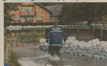
Šest mjeseci nakon katastrofalnih poplava, Hrvatska opet pod vodom

Probleme također očekujemo i u mjestu Sveti Đurad kod Donjeg Miholjca, gdje je potencijalno ugroženo šest kuća u najnižem dijelu naselja - rekao je Haničar, dodavši