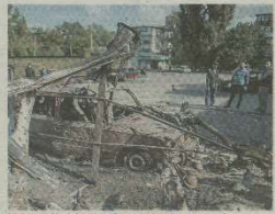
U Ukrajini je poginulo 30 osoba otkad je primirje na snazi od ministra obrane punu borbenu spremnost», rekao je Jaccenjuk. Mirovni plan predsjednika Petra Porošenkina ne znači «opuštanje u radu ministarstava obrane i unutarnjih poslova, potrebna je puna spremnost». «Ne možemo nikome vjerovati, a najmanje Rusima», naglasio je Jaccenjuk. (Hina/AFP)

DONJECK ■ Dva civila ubijena su u pucnjavi u Donjecku, proruskom ustaničkom uporištu na istoku Ukrajine, objavilo se u srijedu lokalne vlasti, dok je premijer Arsenij Jaccenjuk pozvao vojsku na punu borbenu spremnost. «Dvije civilne osobe ubijene su, a tri ranjene», objavila je gradska uprava, dan nakon što su ukrajinski zastupnici usvojili nacrt zakona koji daje više autonomije proruskim separatističkim područjima u okviru mirovnog protokola što su ga potpisali Kijev i separatisti. Zračna luka u Donjecku već je nekoliko dana poprište izmjene vatre. Vojska koja kontrolira infrastrukturu optužuje pobunjenike da pucaju na njezine položaje. Po brojkama agencije France presse, ukupno je do sada, otkad je na snagu stupio prekid vatre 5. rujna, poginulo 30 osoba, 14 civila i 16 vojnika. Vojska i pobunjenici međusobno prebacuju odgovornost za žrtve. Jaccenjuk je od ministarstva obrane zatražio da osigura da snage budu u punoj borbeno spremnosti, bez obzira na prekid vatre. «Rusija nam neće dati mir, zato tražim