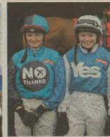
Novinarka Jutarnjeg u Edinburghu (lijevo). Članovi tiste obitelji (gore) ne mogu se usuglasiti oko odgovora