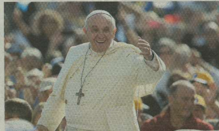
Papa Franjo ne namjerava zbog prijete mijenjati svoju dnevnu rutinu