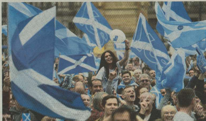
Zagovornici škotske samostalnosti vjeruju da će danas uspjeti biti brojniji od sunarodnjaka koji bi radlje ostali u Uniji

Da stvari s Europskom unijom nisu ni izbliza jednostavne, još je jednom potvrdio španjolski premijer Mariano Rajoy. On je izjavio da bi neovisnost Škotske i Katalonije torpedirala Europsku uniju, a posljedice bi bile snažnija recesija i povećanje siromaštva. Što u posljednje vrijeme o neovisnosti Škotske govori