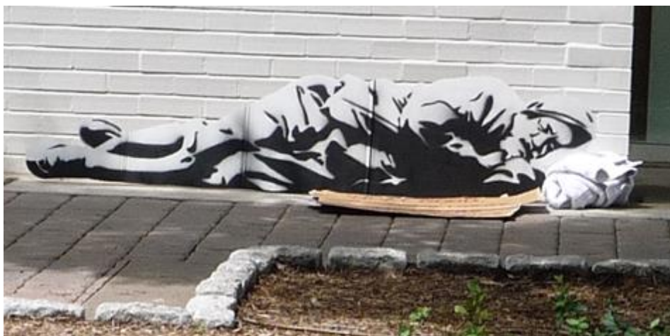
Figure 1. A photo of Blek le Rat’s graffiti project on homelessness.

One of the first graffiti artists in Paris, also known as “the father of stencil graffiti” is Blek le Rat. His style includes using stencil made out of paper or cardboard on which he applies spray paint or roll-on paint. His art is often referred to as guerilla art because of the strong political and social messages. For instance, le Rat devoted many of his works to homeless people in order to raise awareness of this global problem. However, he came to the conclusion that people will walk directly over actual homeless people, but will stop to discuss a painting of a homeless person on a wall (Neu, 2017.).