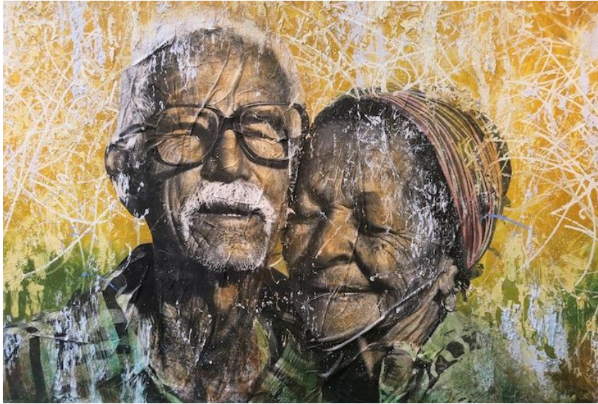
Figure 6. "Wrinkles of the city".

Variety of styles can be recognized in works of street artist Blu who started doing his art works with spray paint but ended up using house paint. In street art scene his works are known as "epic scale murals" due to their size and are mostly themed with sarcastic huge human figures ( Blu Biography , 2018).