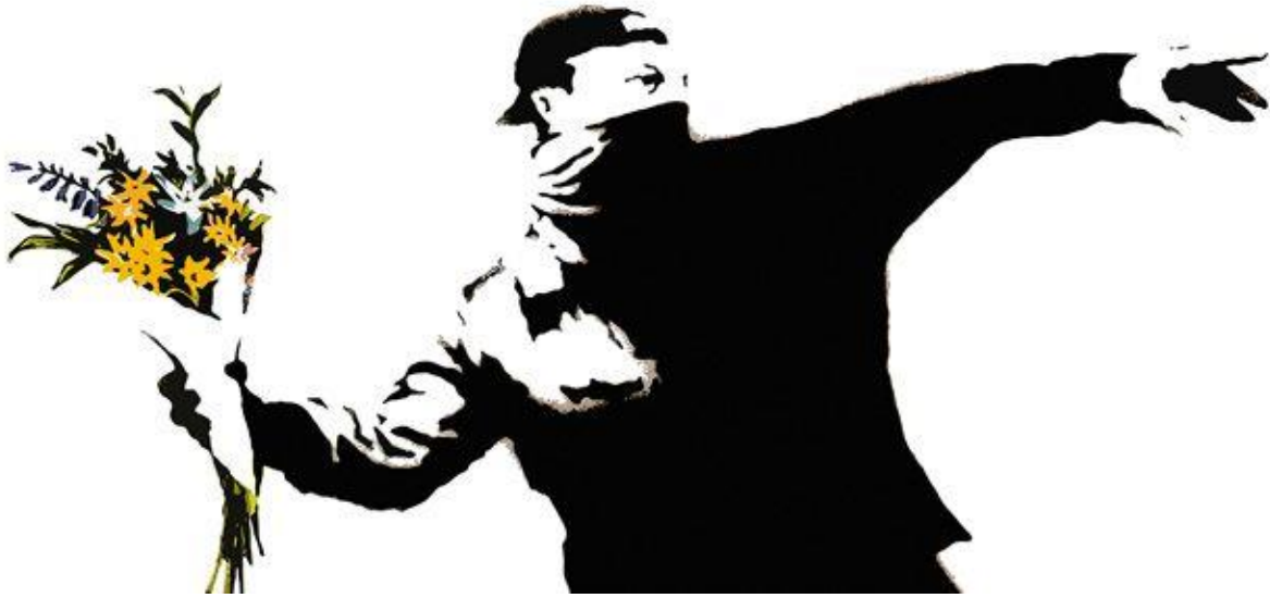
Figure 17. A photo of Banksy’s protester whose Molotov cocktail morphs into a bouquet.

Street art serves as a voice of a common man. Aside from notable artists, street art took part in many important events in history. Street works that appeared during a two-week strike in Paris became valuable works of political design. For example, “It’s forbidden to forbid”, “Elections, a trap for idiots”, “Be realistic, ask the impossible” or “Read less, live more” are just some of the writings that marked that period. Another example is Berlin wall which is, after being painted for 30 years by artists from all over the world, one of the greatest monuments of visual art in history.