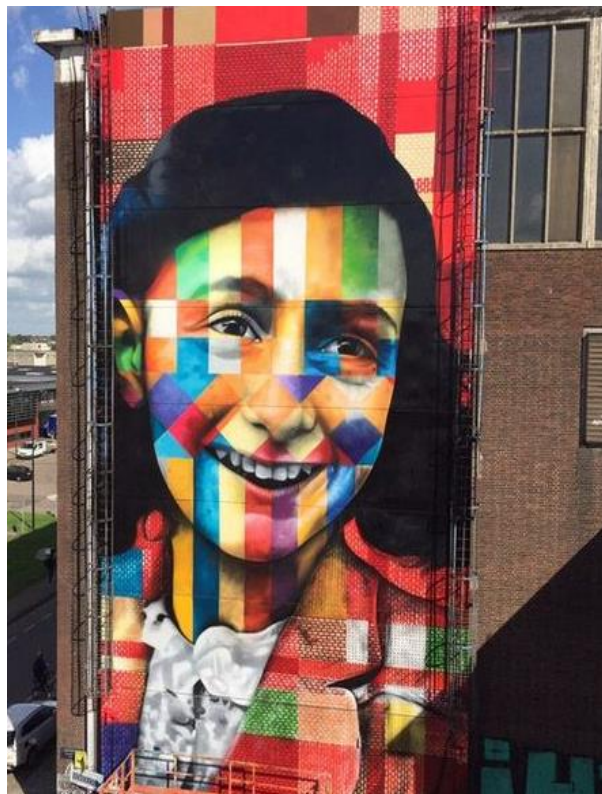
Figure 11. A photo of Kobra's Anne Frank mural in Amsterdam.