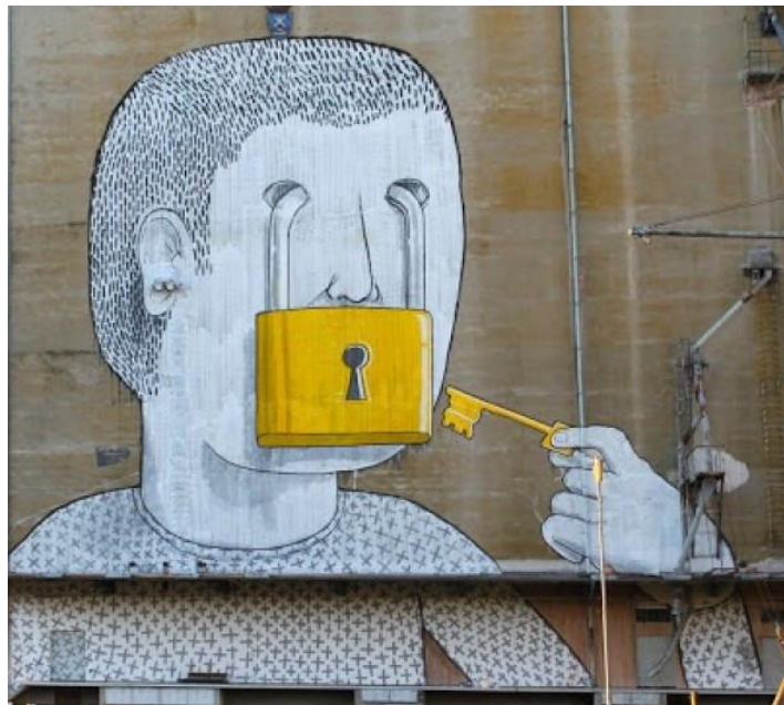
Figure 7. A photo of Blu's street art in Vienna.

Variety of styles can be recognized in works of street artist Blu who started doing his art works with spray paint but ended up using house paint. In street art scene his works are known as "epic scale murals" due to their size and are mostly themed with sarcastic huge human figures ( Blu Biography , 2018).