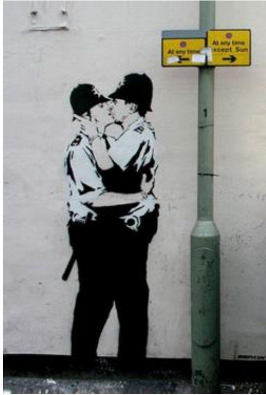
Figure 15. A photo of Banksy's controversial work "Kissing Coppers".