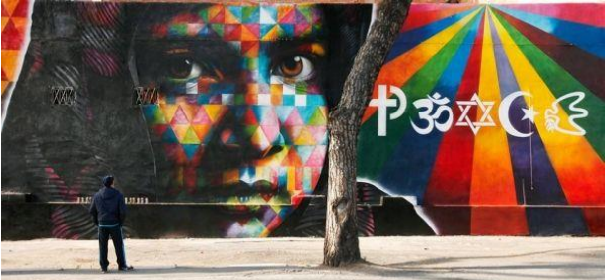
Figure 12. A photo of Kobra's work on the facade of MAAM Museum in Rome.

The artist who covered streets of Valencia in a very significant way is Escif. He conveys a message that makes people stop and think about it, makes them focus on his work instead of just concentrating on pure aesthetic. His work is not only beautiful and elegant but also has an important point to make (Ficpatrik, 2014).