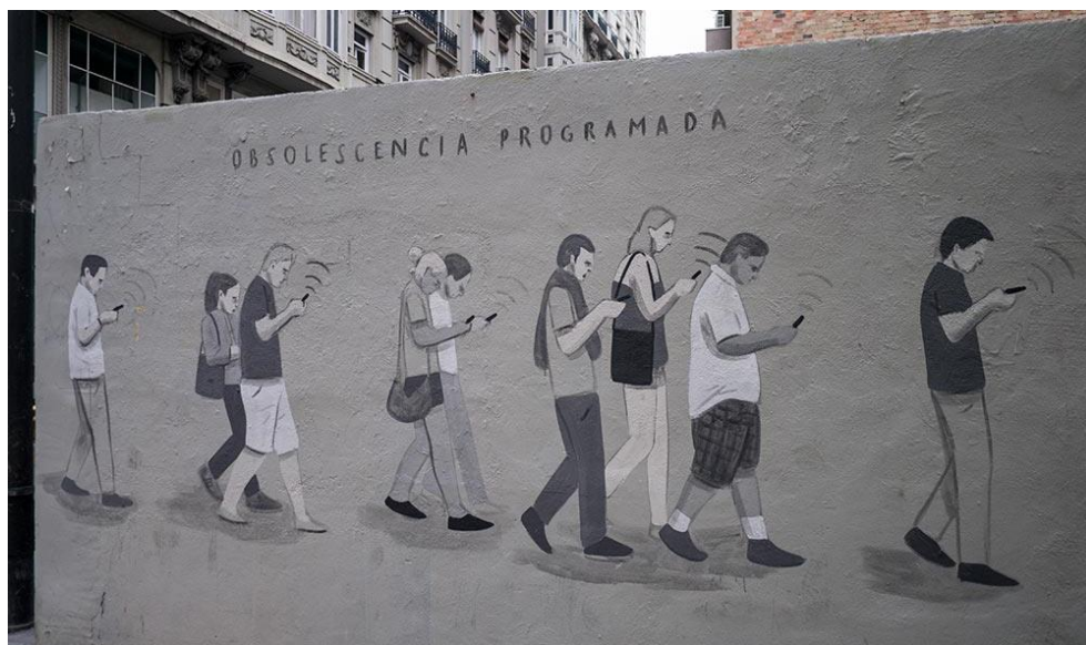
Figure 13. A photo of Escif's work in Valencia.

The artist who covered streets of Valencia in a very significant way is Escif. He conveys a message that makes people stop and think about it, makes them focus on his work instead of just concentrating on pure aesthetic. His work is not only beautiful and elegant but also has an important point to make (Ficpatrik, 2014).