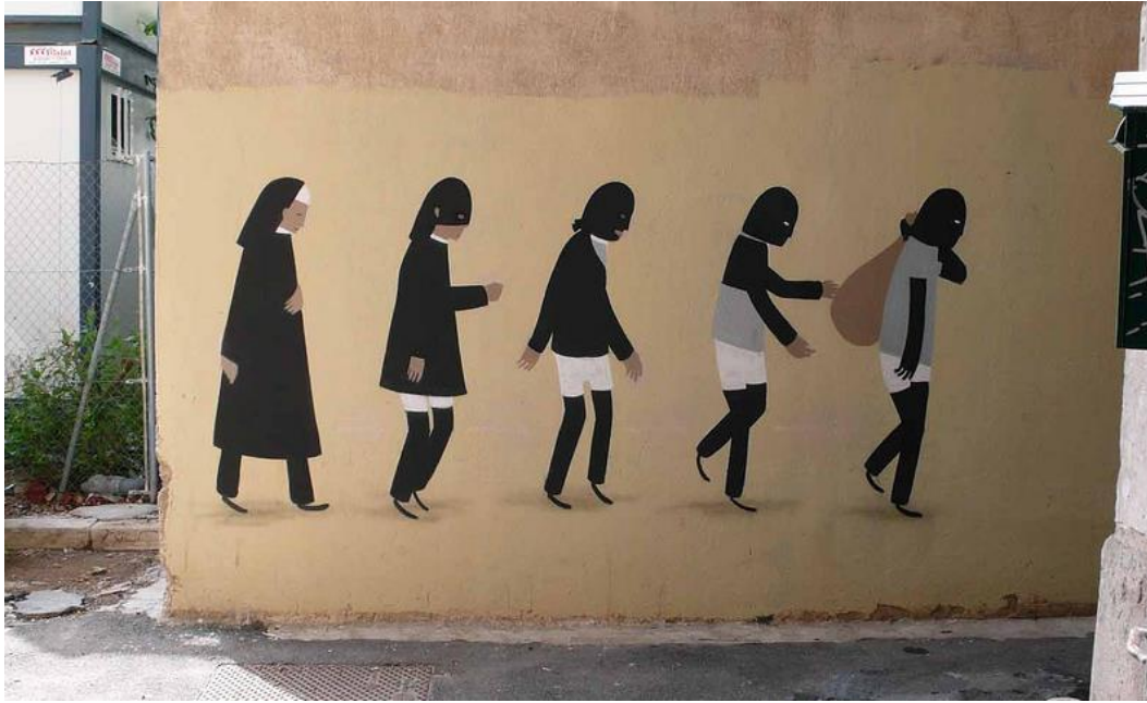
Figure 14. A photo of Escif's work "Nun's metamorphosis on illegal immigrant".

The last street artist I will mention is the most controversial and the most popular one. His identity is still unknown but he is widely known under the name Banksy. Due to his unpredictability, he is a very interesting individual for the media. His works have been appearing on different continents depending on the intervention he wants to make according to happenings in the particular area. Therefore, speculations about his identity are unstoppable. Banksy became appreciated the most owing to the ironic messages he sends through his works. Except for his originality and supreme technique, he knows how to impress the audience. The reason Banksy achieved such fame is because the characteristics of medium are the most expressed in his works. Each of his works provoked a strong reaction and encouraged dialogue. The fact that the Time magazine selected Banksy for the world's 100 most influential people in 2010 alongside Barack Obama and Steve Jobs demonstrates his popularity and achievements (Ellsworth-Jones, 2013).