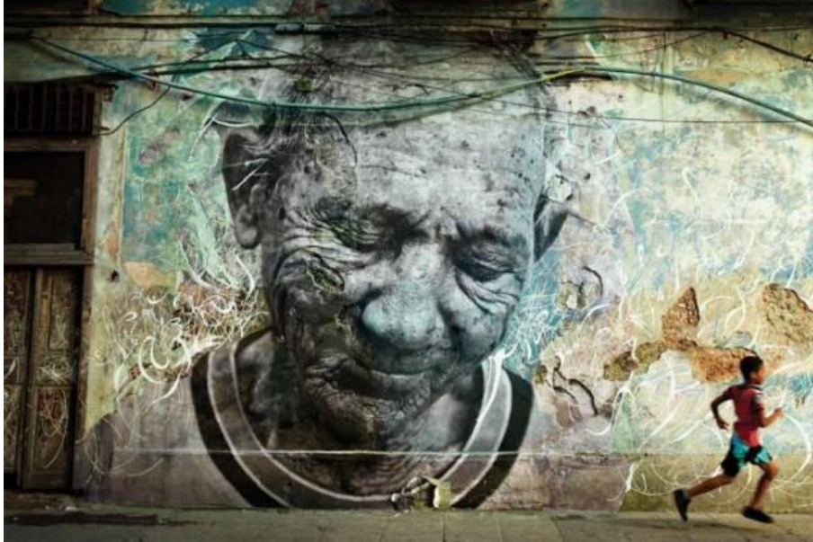
Figure 4. A photo of Parlá's project with JR "Wrinkles of the city".

large images in public places. Parlá's most notable work "Wrinkles of the city: Havana" was made in collaboration with the French artist JR.