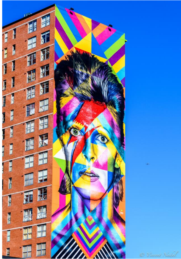
Figure 10. A photo of Kobra's David Bowie mural in New Jersey.