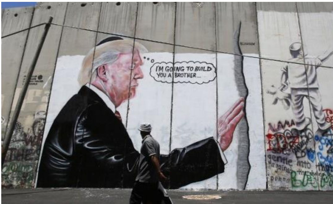
Figure 18. A photo of mural on Israel's West Bank.

To sum up, street art on the internet may not have the best quality and the greatest impact, but the biggest advantage of online street art is undoubtedly its reach. The possibility to share art works from the street has brought the whole street art culture closer to the audience and has made anonymous voices to be heard. One of the examples is the mural believed to be made by the Australian graffiti artist Lushsux which was painted on Israel's West Bank wall. The mural was made after the president of the USA, Donald Trump, has made a visit to Jerusalem (The New Daily).