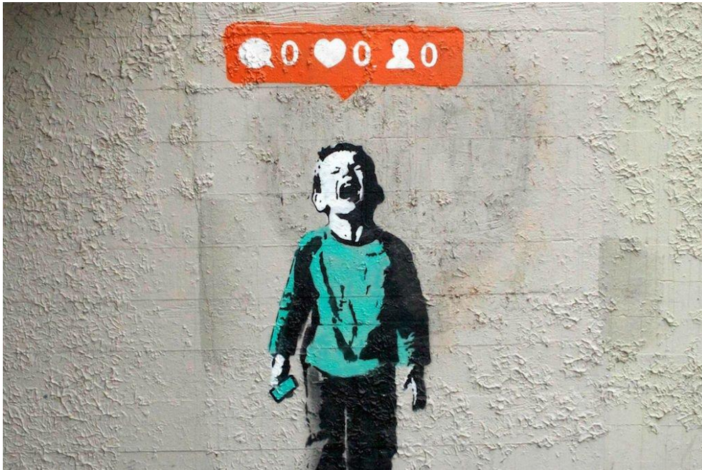
Figure 16. A photo of Banksy's work criticizing social networks.