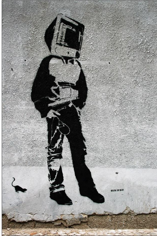
Figure 2. A photo of Blek le Rat's stencil work Computerhead in London.