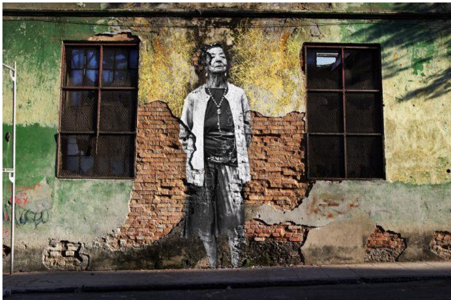
Figure 5. "Wrinkles of the city". Taken from: Jose Parlá (2012).