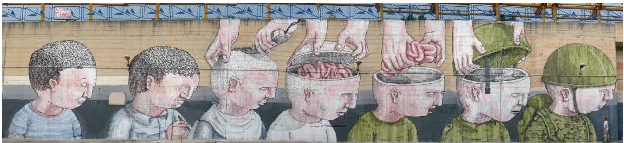
Figure 9. A photo of Blu's work showing brainless soldiers.

Brazilian artist Eduardo Kobra stands out the most owing to his distinctive usage of colors and patterns. The subject of his work are mostly notable people from history, painted as large murals in multiple colors. Kobra's significant technique is repeating squares and triangles throughout the whole surface of his murals and filling it with differently shaded lines. Thus, his work is widely appreciated and often awakes nostalgic feelings due to its subject (Figuerola, 2018).