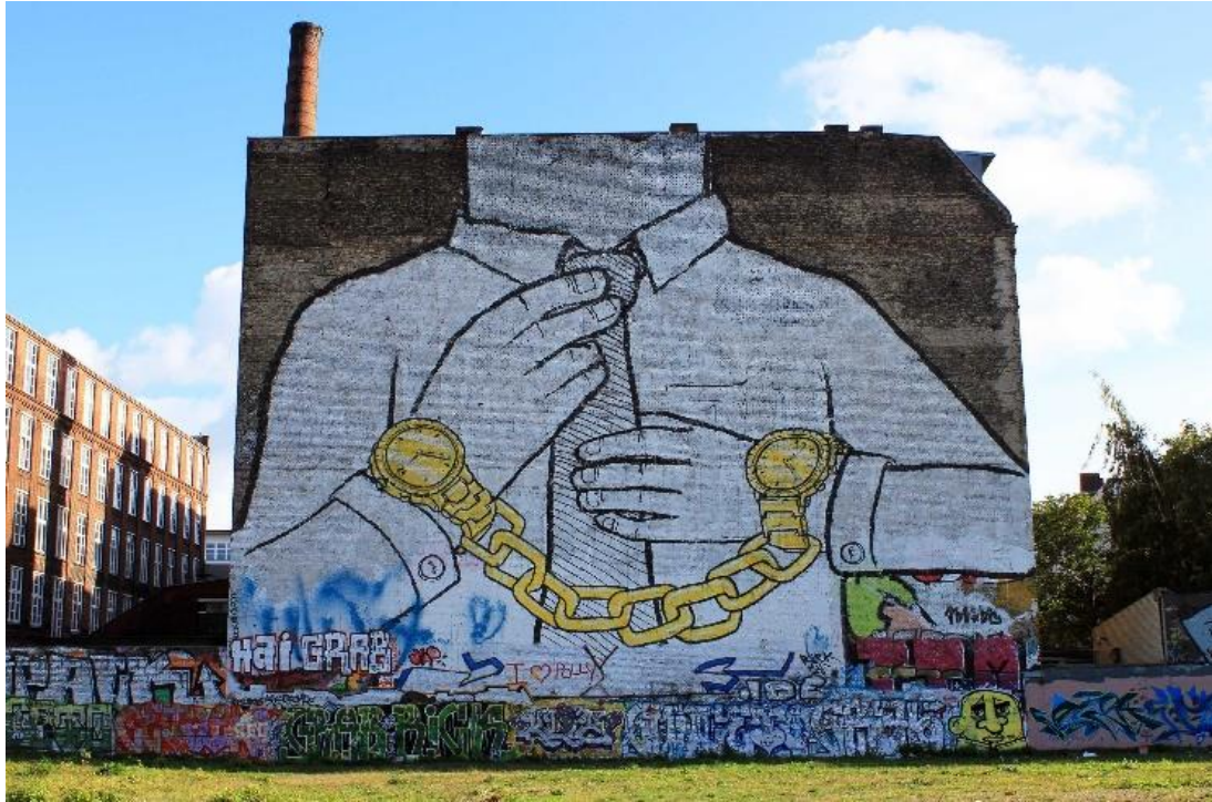
Figure 8. A photo of Blu's street art in Berlin.