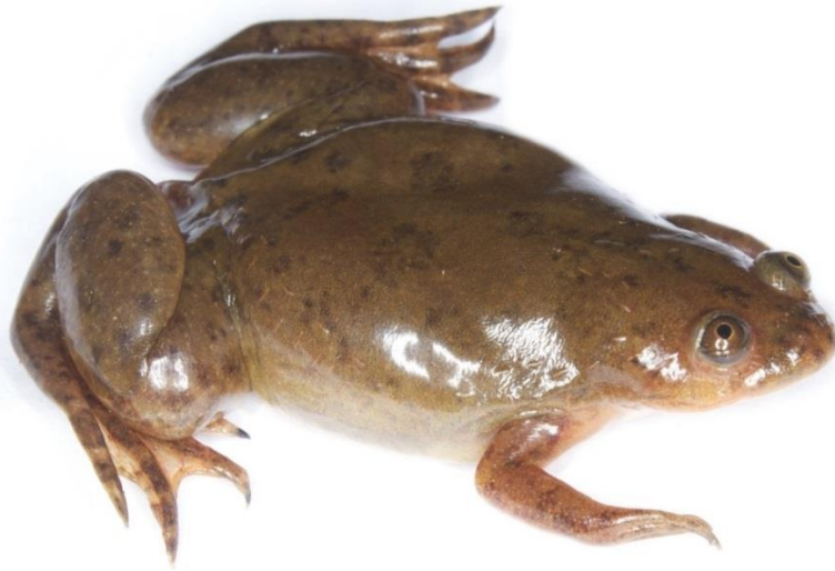
Figure 1. Xenopus laevis