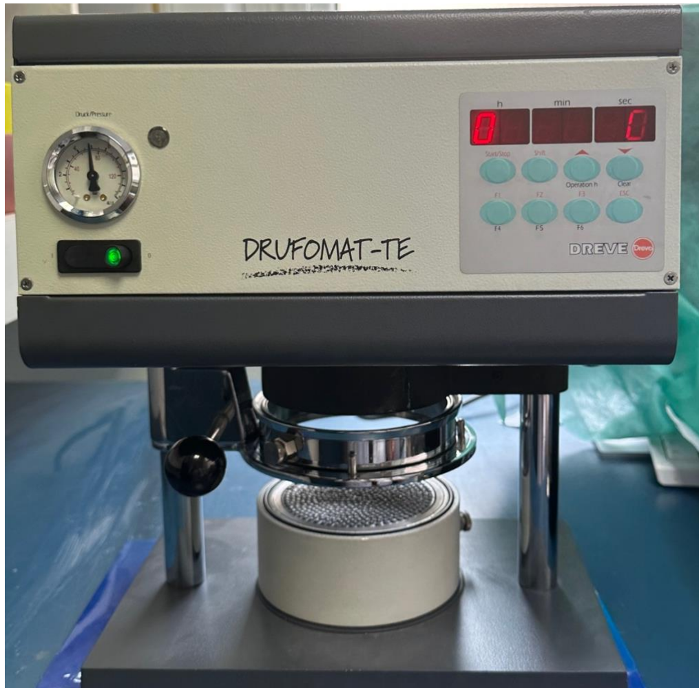
Figure 3. Dreve Druformat-Te mouthguard manufacturing device