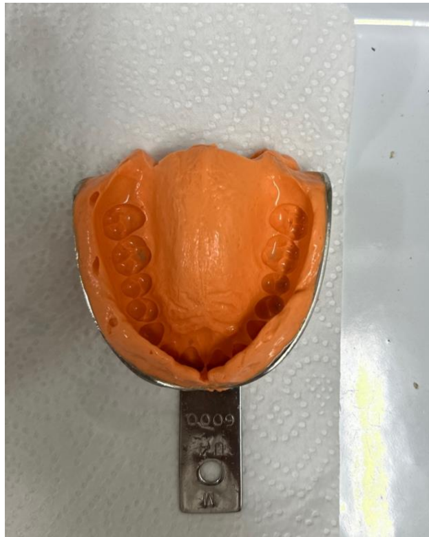
Figure 1. Alginate impression of maxillary teeth and soft tissue