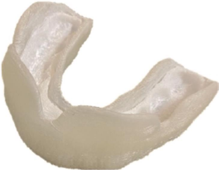
Figure 5. 4D-printed Mouthguard Adapted from (9)