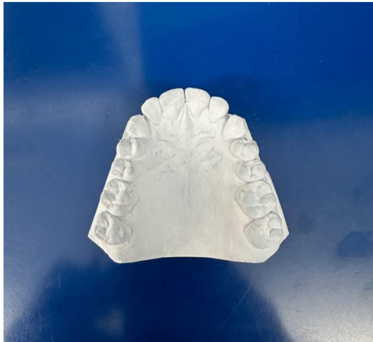
Figure 2. Cast of upper jaw