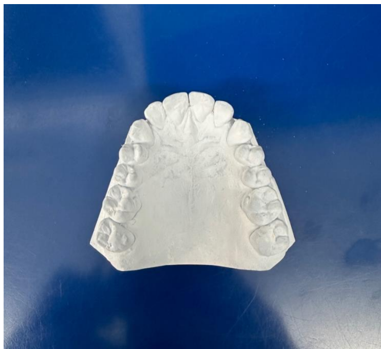
Figure 2. Cast of upper jaw