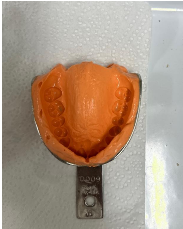
Figure 1. Alginate impression of maxillary teeth and soft tissue