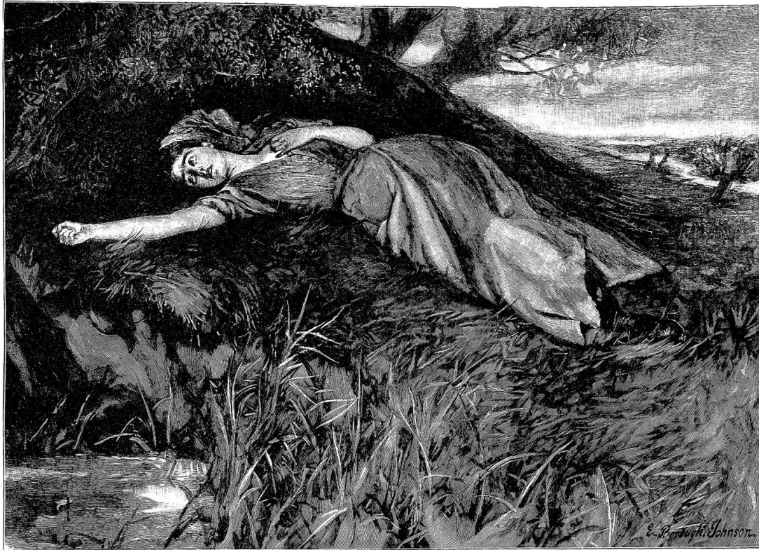
"Tess flung herself down upon the undergrowth of rustling spear-grass as upon a bed."

between confessing her relationship with Alec and accepting Angel's marriage proposal.