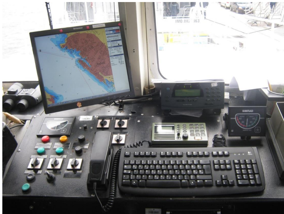
Picture 9. ECDIS - Catamaran Olea

„Electronic chart display and information system (ECDIS) means a navigation information system which, with adequate back-up arrangements, can be accepted as complying with the up-to-date chart required by regulation V/20 of the 1974 SOLAS Convention, by displaying selected information from a system electronic navigational chart (SENC) with positional information from navigation sensors to assist the mariner in route planning and route monitoring, and by displaying additional navigation-related information if required.“ [7]